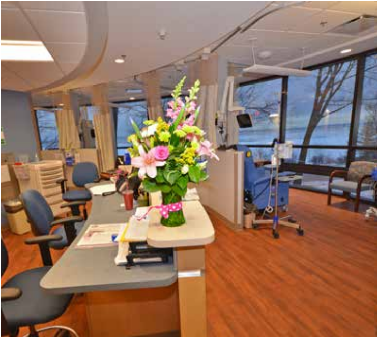
Peaceful views at the Chemotherapy and Infusion Center at Munson Healthcare Charlevoix Hospital.