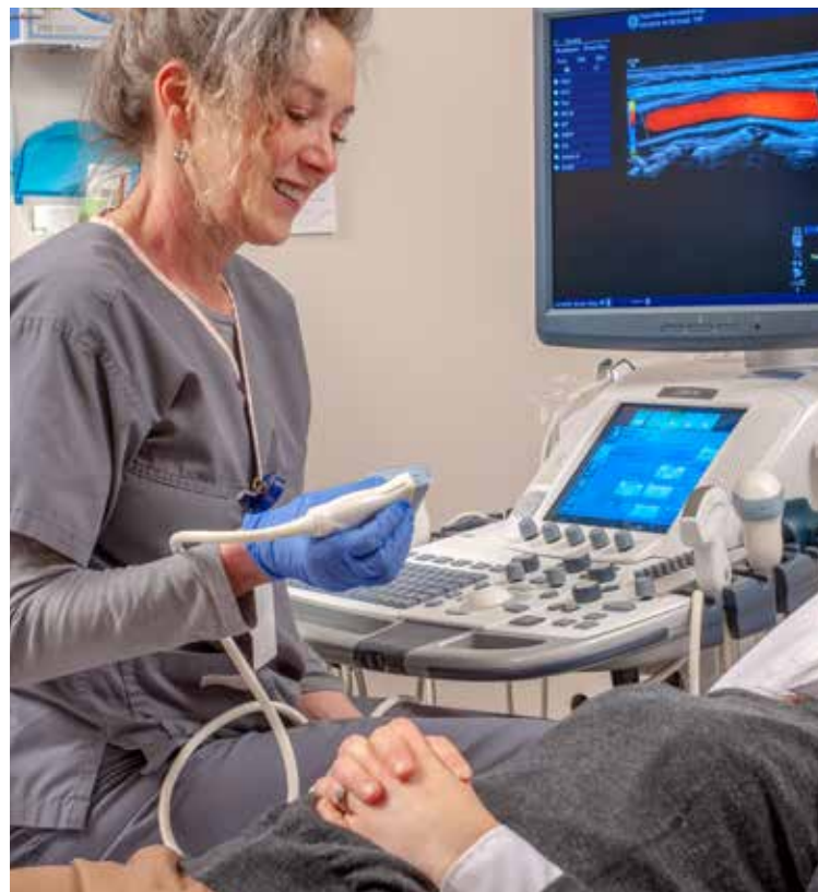
Cardiac testing at POMH. Photo taken before COVID-19.

Over $342,000 was donated to Otsego Memorial Hospital to help purchase a new stereotactic breast biopsy table, which pinpoints breast tissue to identify cancerous cells and determine the best possible treatment plans.