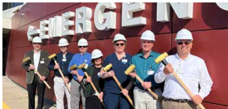
A ground-breaking ceremony for the emergency department renovation took place in March of 2022.

Bringing this project to life would not have been possible without your support. Manistee Hospital employees, patients, and generous donors came together to raise over $1 million for this project. Thank you!