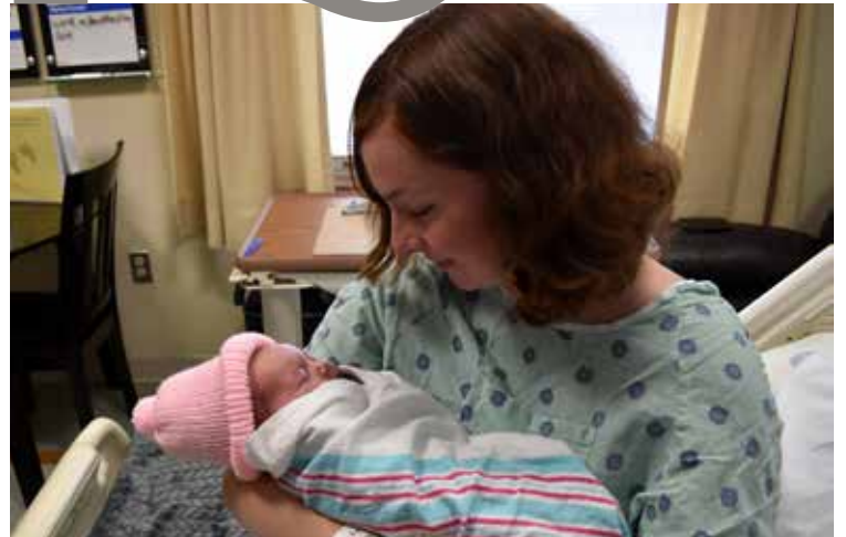
Mother and baby at Cadillac Hospital. Photo taken before COVID-19.